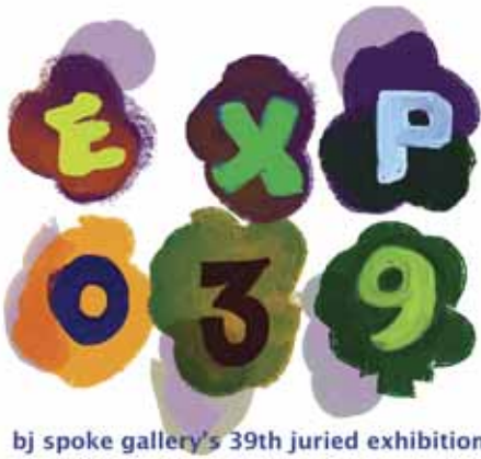
bj spoke gallery's 39th juried exhibition