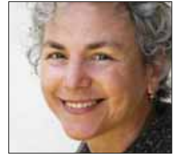
Ellen Bass

Bass was elected a Chancellor of the Academy of American Poets in 2017. She is the recipient of fellowships from the California Arts Council and the National Endowment for the Arts, as well as the Lambda Literary Award for Poetry, the Pablo Neruda Prize for Poetry, and two Pushcart Prizes. She teaches in the low-residency MFA program at Pacific University and lives in Santa Cruz, California.