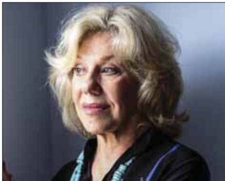
Erica Jong

This project is made possible with funds from the Decentralization Program, a re-grant program of the New York State Council on the Arts with the support of Governor Andrew M. Cuomo and the New York State Legislature and administered in Schoharie County by CREATE (formerly the Greene County Council on the Arts).