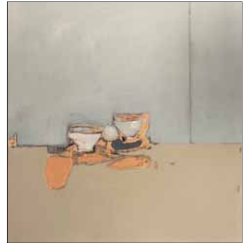
They Are Strangely Settled and Ready. Are They? by Ilene B. Spiewak, acrylic with pressed charcoal, 36" x 35".

Founded in 1972, Spencertown Academy Arts Center is a cultural center and community resource