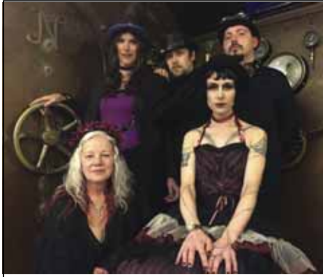
Dust Bowl Faeries, image courtesy of Ryder Cooley.

(DEC) Live Music: DUST BOWL FAERIES. One night only performance by the Dust Bowl Faeries , during the run of ACC's fall exhibit HOMELY . 7:30pm-8:30pm. This event is free and open to the public. Athens Cultural Center, 24 Second Street, Athens, NY. Visit www.athensculturalcenter.org .