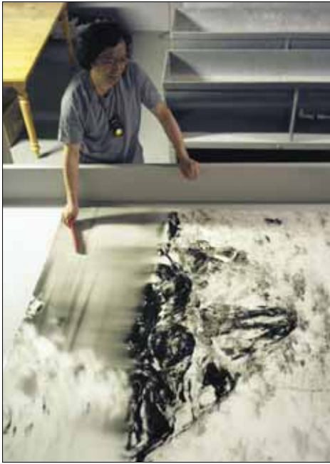
Shi Guorui, Catskill Creek, May 21 2019, unique Camera Obscura Gelatin Silver print, 69 x 45 in.

The solo exhibition of new work by acclaimed contemporary artist Shi Guorui is on display through December 1, 2019 in the 1815 Main House of the Thomas Cole Historic Site. The exhibition presents spectacular landscape photographs up to 15-foot wide, created using a camera obscura, that pay homage to the landscapes and legacy of Thomas Cole (1801-1848), founder of America's first major art movement, now known as the Hudson River School of painting.