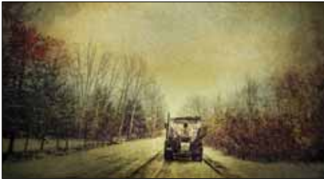
Dan Burkholder, Plow on Rural Road, Greene County, Photograph.