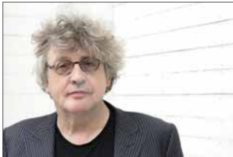
Paul Muldoon

Paul Muldoon is a Fellow of the Royal Society of Literature, the American Academy of Arts and Sciences and the American Academy of Arts and Letters. In addition to the Pulitzer Prize, he has received an American Academy of Arts and Letters award in literature, the 1994 T. S. Eliot Prize, the 1997 Irish Times Poetry Prize, the 2003 Griffin International Prize for Excellence in Poetry, the 2004 American Ireland Fund Literary Award, the 2004 Shakespeare Prize, the 2006 European Prize for Poetry, the 2017 Queen's Gold Medal for Poetry and the 2018 Seamus Heaney Award for Arts & Letters. He is the recipient of honorary doctorates from ten universities.