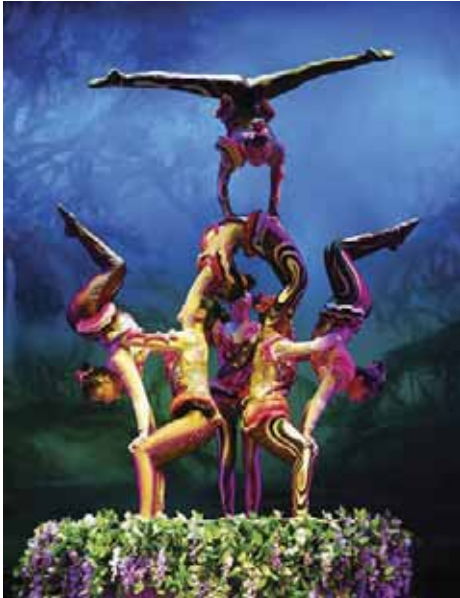
Catskill Mountain Foundation begins its mid-autumn line up of performances on October 12 with Cirque Mei, a company of 40 circus artists and acrobats.