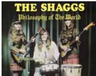
Image courtesy the album cover.

Come enjoy some hot summer evenings (and afternoons) in the air-conditioned comfort of Catskill's intimate and affordable Bridge Street Theatre. Here's a sampling of the adventurous programming we've got coming up for you during the months of July and August.