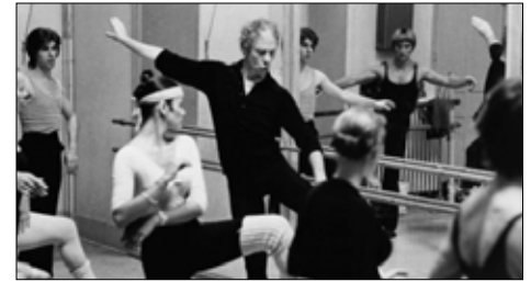
Merce with Paris Opera.

Hudson Hall hosts Natalie Merchant on Friday, August 9 at 8pm. Tickets are $45 and available at Hudsonhall.org or 518-822-1438. "I've reached a point in my career of wanting