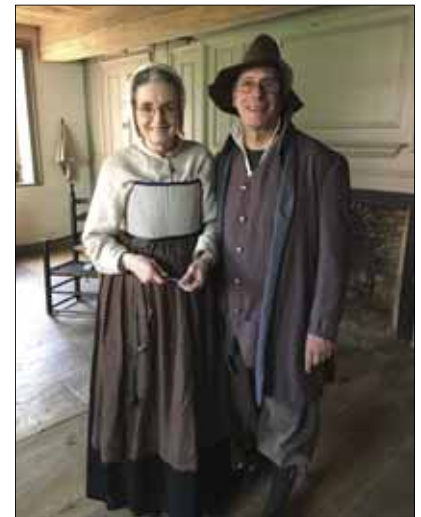
By candle light costumed volunteers will serve tavern guests a beer from a local brewery to replicate a beer offered at Pieter's Beverwijck tavern circa the 1650's at the Bronck Museum.

The Bronck Museum offers current GCCA Members a discount on adult admission during the regular tour schedule (some restriction apply including Tavern Night) during its 2019 season.