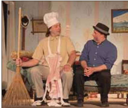
Left: The Esperance Historical Society presented "Go Slowly, Averil" in June.