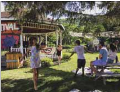
Prattville Art Center volunteers helping setting the stage for Headed for the Hills festival.

Prattville Art Center & Residency once again hosts "Headed for the Hills" music and art festival August 2-4, 2019. This free festival, now in its fourth year, brings a kaleidoscopic mix of high-energy performers to Prattville, NY, to a small town high in the Catskill Mountaintop. The festival celebrates "Diversity on Main Street" and highlights women, LGBTQ performers, and artists of color, featuring over two dozen performers in a three-day town-wide festival. Friday evening begins with High-profile indie rock bands from across the Northeast will join regional cabaret artists Saturday the Dust Bowl Faeries, drag kings from Casanova's Royal Court, NYC DJ Bebe, AfroYaqui Collective.