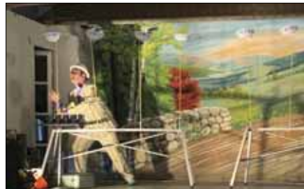
Below: Scene from Panther Creek Arts annual Tiny Arts in a Tiny Town arts festival.