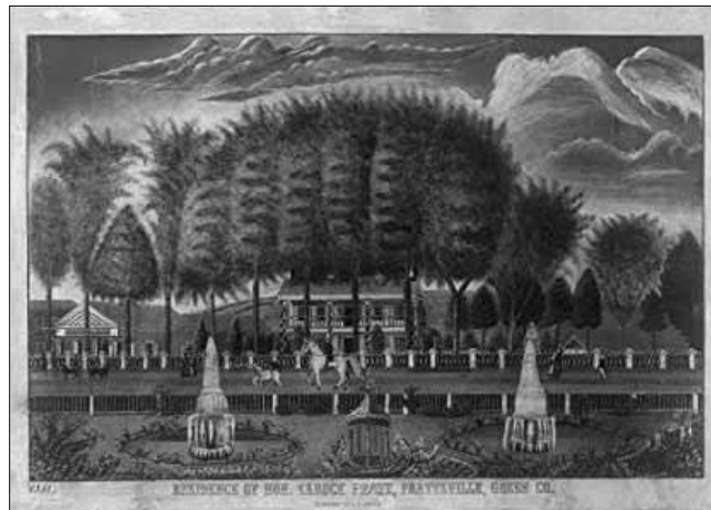
Image of Zadock Pratt residence