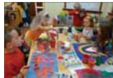
Young artists in the Sprouts Program at Work making a back drop.

register early to secure your place. Can't come to the program at your closest location? You are welcome to sign up at another location. Multiple week registration is also available; we may need to put you on a wait list so we can enroll as many children as possible.