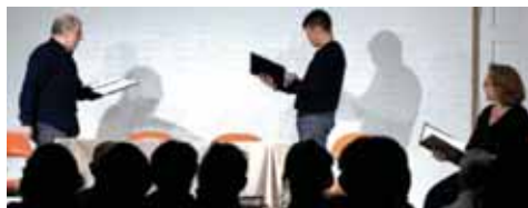
HRC Showcase Theatre will present its third and fourth staged readings of its 26th Season.

HRC Showcase Theatre, the premier theatre company in the Hudson River Valley solely dedicated to staged readings of new plays, will present the third and fourth staged readings of its 26th season on March 18 and April 16, 2017.