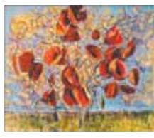
Romanian Poppies by Maya Farber, Mixed Media: Gold Leaf with Oil on Canvas, 24 x 22 inches.

cast glass, manipulated and expressed through vibrant color. New to the gallery, is Color Field Sculpture by Shelley Parriott. Miniature interior to large-scale installations simultaneously present visual and perceptual dichotomy; an integration between the corporeal and the intangible of the physical and spiritual. Monumental in size and impact, yet illusory, transparent layers play in the changing light as they describe Material versus Immaterial, Being