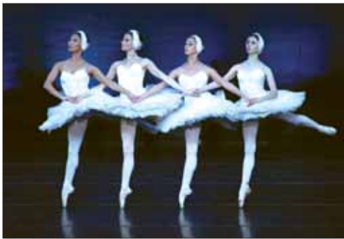
Top: Apollo's Fire takes the stage on March 25, 2017 at the Doctorow Center for the Arts in Hunter, NY.