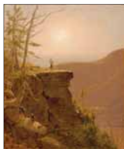
Sanford Gifford, Ledge on South Mountain, in the Catskills, ca. 1861-62. Oil on canvas, 12 7/8 x 10 3/4 in. Framed: 17 1/4 x 15 x 2 1/4 in. Harvard Art Museums/Fogg Museum, Gift of Sanford Gifford, M.D. 2006.1.

Thomas Cole's home, studios, and special exhibitions are open April 30 through October 29, 2017, Tuesday-Sunday from 10 to 5pm. The site is located at 218