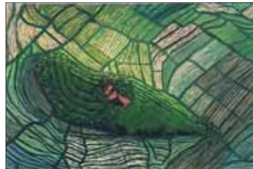
Left Top: "11 pond capturing heavy metals and sulphids from mining, Portugal" Joy Wolf. Wax and Oil Painting on Canvas.