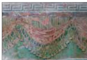
Painted frieze in East Parlor at Thomas Cole's Cedar Grove.

U.S. Congressman John Faso (19th District: Columbia, Greene, Rensselaer) 2 Hudson Street, PO Box 775, Kinderhook, NY 12106 Tel: (518) 610-8133 Fax: (518) 610-8135 U.S. Senator Charles E. Schumer Leo O'Brien Federal Office Building, Room 420, Albany, NY 12207 Tel: (518) 431-4070 Fax: (518) 431-4076 U.S. Senator Kirsten Gillibrand 478 Russell Senate Office Building, Washington, DC 20510 Tel: (202) 224-4451 Fax: (202) 228-0882