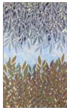
"Heaven and Earth" by Sayzie Carr acrylic gouache on paper.

The exhibit is at ASCC, 1198 Route 21c in Harlemlive, NY at the intersection of Harlemlive Road and Route 21C. Visit www.artschoolofcolumbiacounty.org , email info@artschoolofcolumbiacounty.org or call 518-672-7140 for more information.