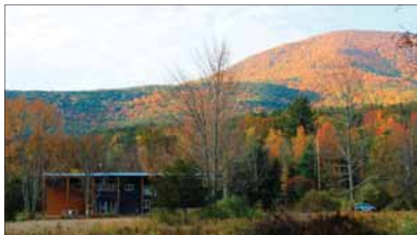
Wave Farm in the fall season.

Applications will be evaluated in a peer review panel comprised of transmission artists, past residents, and Wave Farm staff. Finalists will be contacted for phone interviews, and notification will be made in March.