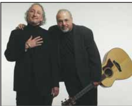
Aztec Two Step