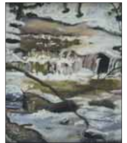
Icy Stream by Larua Garamone, pastel.

the expression of non-verbal but meaningful messages to the eye and heart. She finds inspiration from storms and creates paintings of gray skies and gathering clouds.