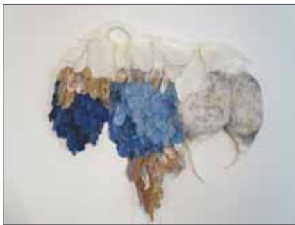
Ellen Jouret-Epstein, Big Blue (2016) Felted wool, linen thread, plaster, wire 35" H x 39" W x 4" D.

Classes are held at the Old Schoolhouse, 1198 Route 21c in Harlemlive, NY at the intersection of Harlemlive Road and Route 21c. Next to the Hawthorne Valley Farm Store, the building is centrally located within Columbia County, a ten minute drive from Chatham, and one mile from the Taconic Parkway, at the Route 21c exit. To register for classes online, go to artschoolofcolumbiacounty.org . More information at info@artschoolofcolumbiacounty.org or 518-672-7140.