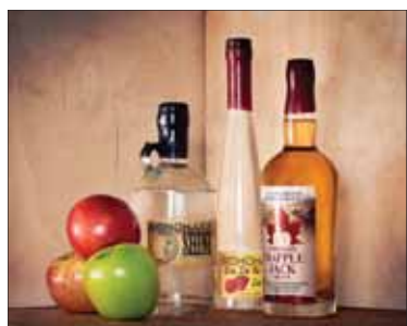
Kymar Distillery in Charlotteville is just one of the many businesses that help support the "behind the scenes" re-grant work in Schoharie County.