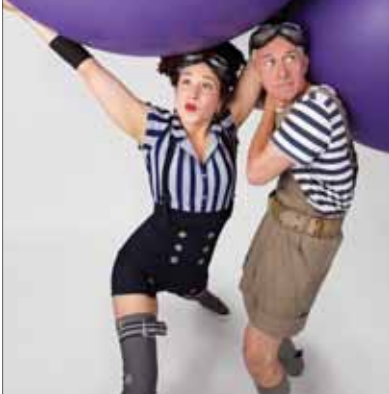
CMF presents Peter Rabbit on May 7th and the Kamikaze Fireflies will perform daring stunts on Saturday, June 4 at the Doctorow Center for the Arts.