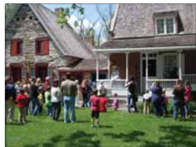
Association Day at the Bronck Museum.

The Bridge Street Theatre performances and events are made possible, in part, by the Greene County Council on the Arts through the Greene County Legislature's County Initiative Program.