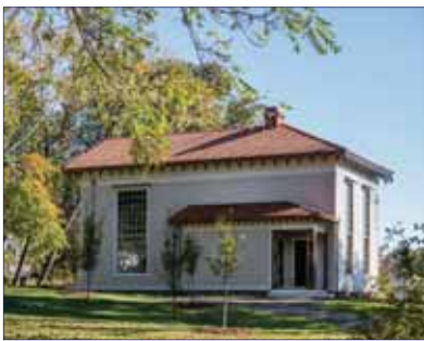
The "New Studio" Building at TCNHS.