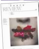
Cover The Photo Review November

One of the world's leading photography curators, Malcolm Daniel, Curator of Photography at the Museum of Fine Arts, Houston, and previously a photography curator for many years at the Metropolitan Museum of Art in New York City, will be the juror for the 2016 Photo Review Photography Competition. The Photo Review, a highly acclaimed critical journal of photography, is sponsoring its 32nd annual photography competition with a difference. Instead of only installing an exhibit that would be seen by a limited number of people, The Photo Review will reproduce accepted entries in its 2016 competition issue and on its website. Thus, the accepted photographs will be seen by thousands of people all across the world and entrants will have a tangible benefit from the competition.