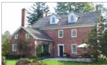
Shown above is a 1795 brick Federal style house, one of 12 sites on the Greene County Historical Society's 40th annual Tour of Homes.

Explore Cossackside from the river to the hills on Saturday, June 4, 2016 with the Greene County Historical Society's 40th annual Tour of Homes from 10 a.m. to 4 p.m.