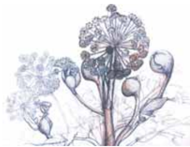
"Angelica" 2015 by Ruth Leonard, detail of drawing.