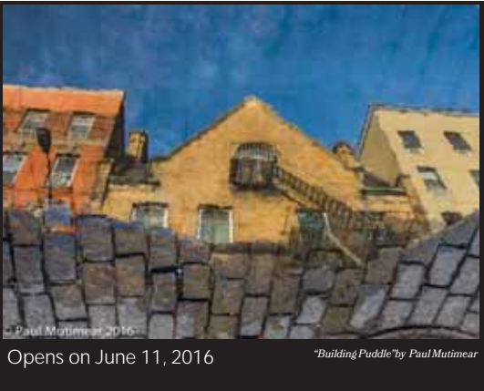
Opens on June 11, 2016