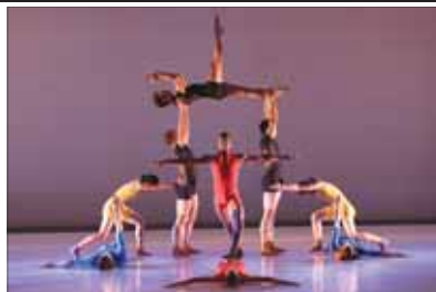
Jessica Lang Dance performed at the Hudson Valley Dance Festival in 2015.

Hudson Valley Dance Festival is sponsored by The New York Times, United Airlines and City