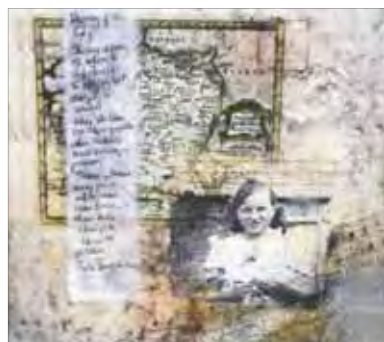
Innocent by Maria Kolodziej-Zincio, Encaustic; beeswax, 20 x 20 inches, 2013

CMF programming is made possible, in part, with funds from the Greene County Legislature through the Greene County Cultural Fund administered by the GCCA.