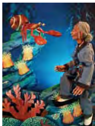
Tanglewood Marionettes production "The Dragon King" is a heart-warming tale that will thrill the young and old alike.