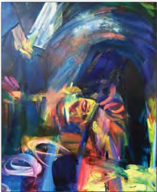
Obstinate Bundle of Longing II, Margo Pelletier. Oil on Canvas, 1987, 36" x 44"

On View September 12 through November 7, 2015