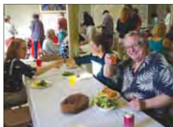
Artist and friends exchange ideas and share fellowship at the Community Potluck dinners third Friday of every month in Hudson.

To register for classes online, go to artschoolofcolumbiacounty.org . For more information, email info@artschoolofcolumbiacounty.org or call 518-672-7140.