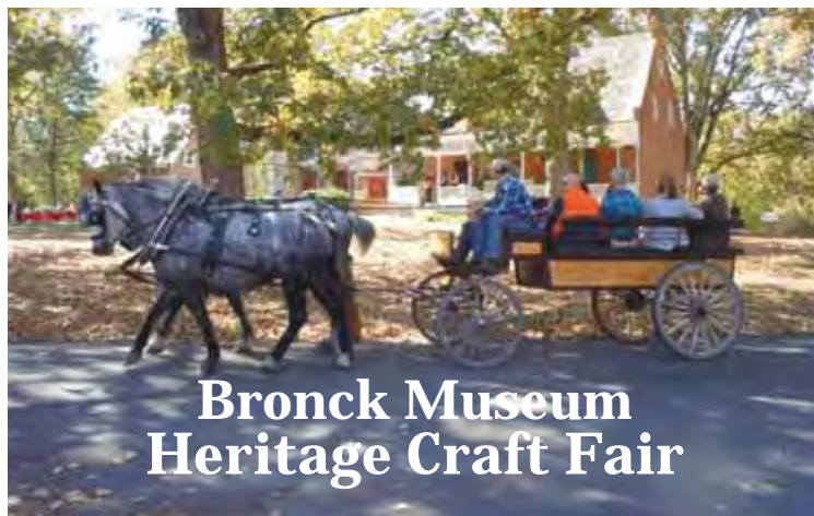
A wagon pulled by dappled gray farm horses will take Heritage Craft Fair goes for a little trip to Kalkberg ridge.