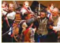
Scene from recent production of Les Miserables by The Two Of Us Productions.

marks is presenting musicals with full orchestras, a rarity that is a great treat for their audiences. They have performed at a variety of venues throughout the area including: Jesus Christ Superstar , Into The Woods , Spamalot & the NE regional premiere of Ragtime at the Performing Arts Center at Taconic Hills in Craryville, NY; the NE regional premieres of next to normal and Tale of Two Cities in Hudson, NY. Chicago at the BCC Boland Theater in Pittsfield, MA; Arthur Miller's Broken Glass at the Valatie Community Theatre in Valatie, NY; The Owl and the Pussycat at the Cuneen-Hackett