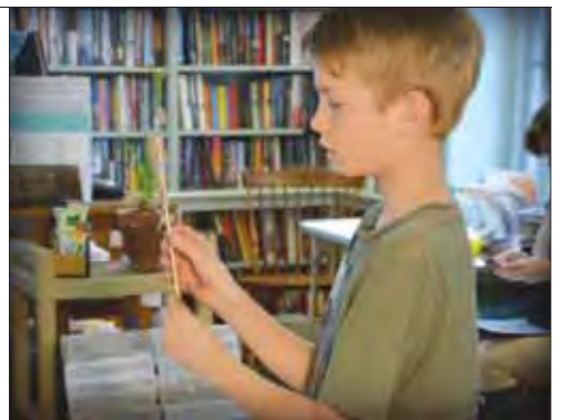
Student making a Jabberwocky-inspired puppet at the Claverack Free Library. Image used with photo release from parent/guardian for ASCC's publicity purposes.

The Art School of Columbia County is a 501(c)(3) non profit organization, dedicated to “imagining art for everyone.” In addition to its classes for older teens and adults, the Art School offers free programs for children in the community and ARTalks, a series of pop-up exhibits and art discussions. More information is available at 518-672-7140, artschool.ofcolumbiacounty.org or info@artschoolofcolumbiacounty.org .