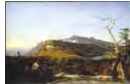
The same view as seen in 1855 and in 2005. Top: view from Art Trail site #7 in the Catskills. Bottom: Jasper Cropsey, Catskill Mountain House, 1855. The Minneapolis Institute of Arts.

The Thomas Cole National Historic Site invites you to join them on a Hudson River School Art Trail hikes. These guided hikes go to the painting sites of the 19th-century artist Thomas Cole and his contemporaries including Frederic Church, Jasper Cropsey, Sanford Gifford, and Asher B. Durand. Participants will be able to see the same views that appear in famous landscape paintings and will have the fun of comparing the painted and actual views. The 19th-century artists hiked, sketched and painted in the region surrounding Thomas Cole's home in Catskill and Frederic Church's home, Olana, as well as sites throughout the Hudson Valley and beyond. Many of these views are spectacularly preserved and offer a dramatic window into the past. More information about the Hudson River School Art Trail can be found at www.hudsonriverschool.org .