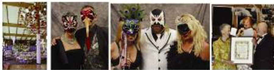
2012 Beaux Arts Ball at Hunter Mountain