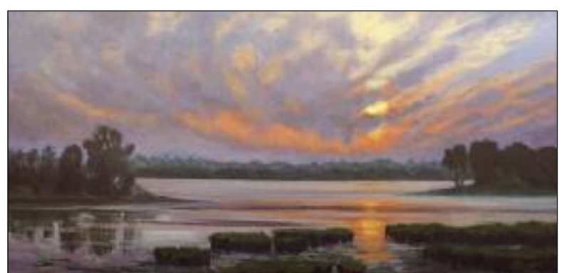
"Stockport Estuary" by Arlene Boehm.