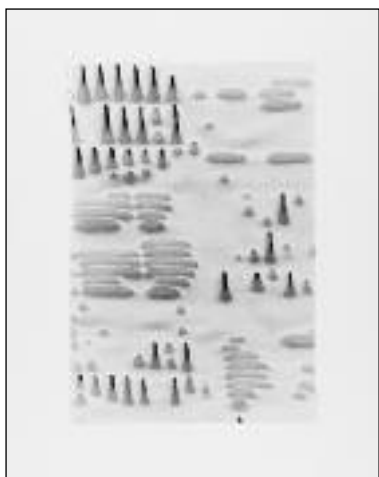
"My DNA"

An opening reception will be held Saturday, Jan. 12 from 4 to 6p.m. Photographer's Art Talk will be held Saturday Jan. 19 from 1 to 2 p.m. All events take place in the Gallery and the public is welcome.