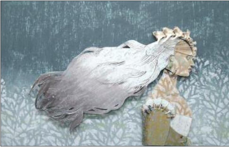
Above: "Empress in Winter", bricolage by Polly Law.

Non-Profit Org. Postage PAID Permit #1408 Newburgh, NY 12555