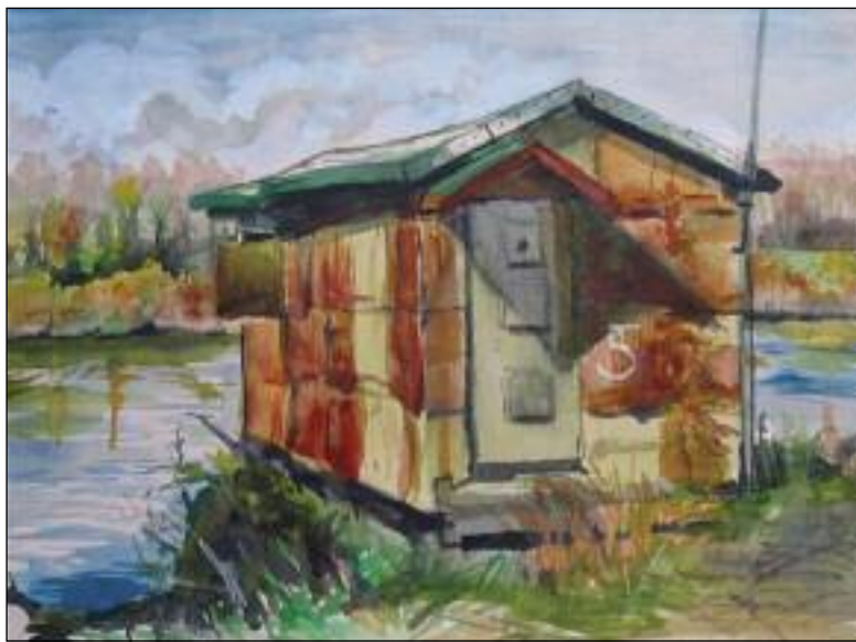
"Shack #5," watercolor by Gretchen Kelly.

These buildings will always be a part of Hudson's rich histo-